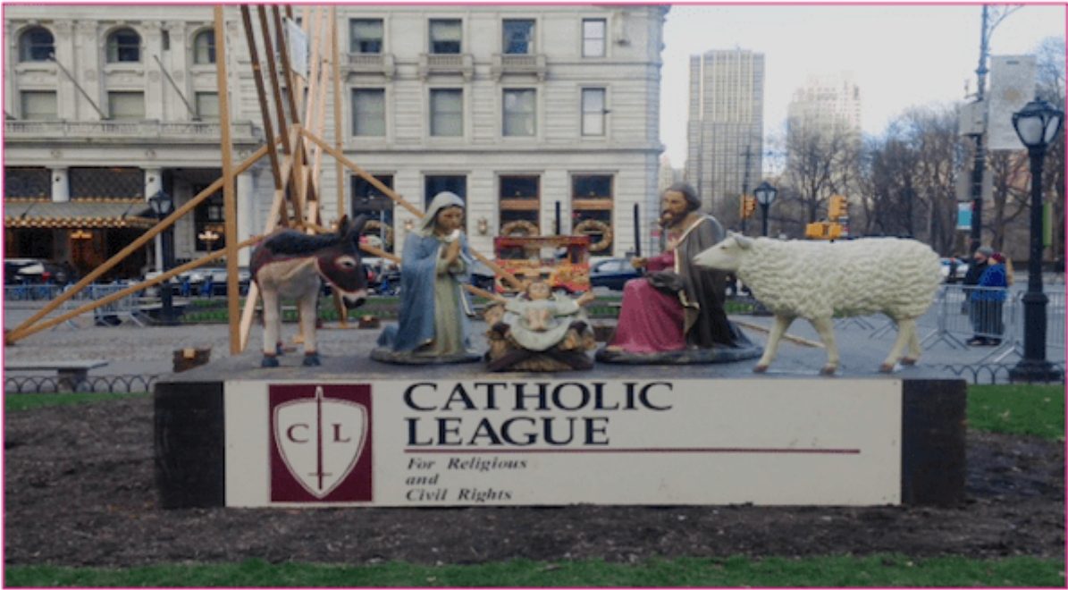
The Catholic League's annual nativity scene in New York City's Central Park was erected in a spot just south of the Park: It was on 5th Avenue, between 58th and 59th Street, in front of the Plaza Hotel.