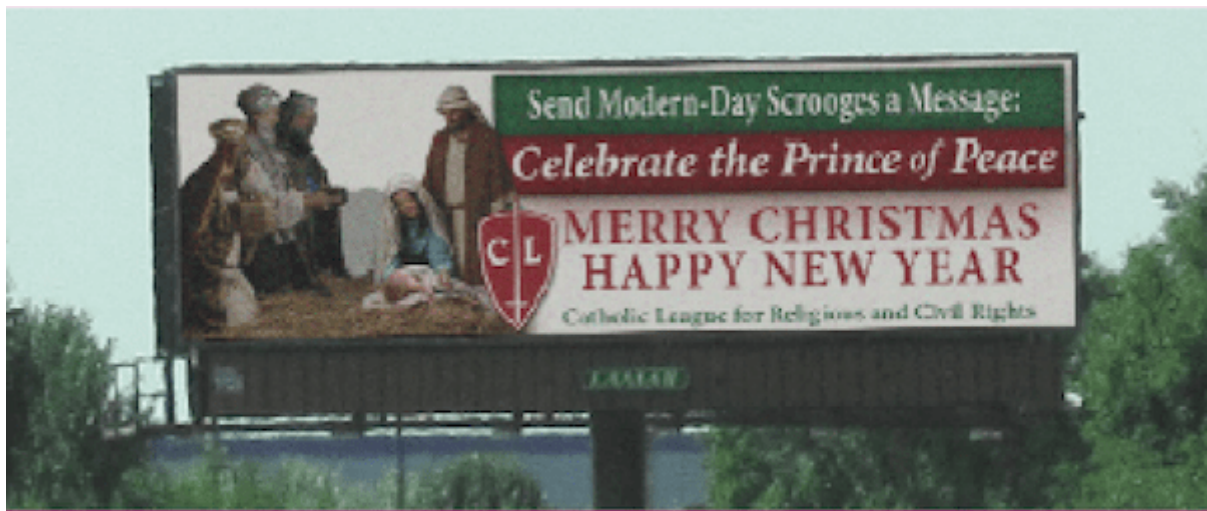
This digital billboard was placed in two locations in New Jersey; one was on Route 18 at the Route 527 Intersection, and the other was on I-95 in South Brunswick, between exits 9 and 8A, heading south.

After a lawyer from Advocates for Faith & Freedom contacted the school on the student's behalf, he was permitted to hand out the candy canes with the messages, but it had to be done off campus and on the last day before the students left for winter break. The school superintendent said the teacher's intention was to "maintain an appropriate degree of religious neutrality in the classroom."