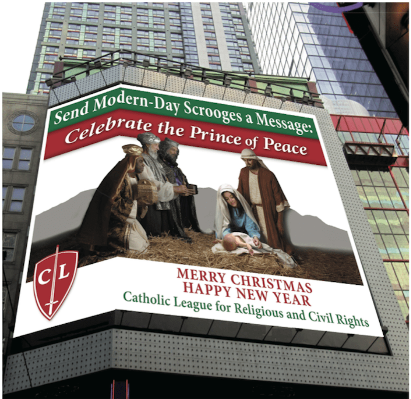
This billboard was placed in Times Square on West 42nd Street between 7th and 8th Avenues. It was on display from December 9, 2013 through January 5, 2014.