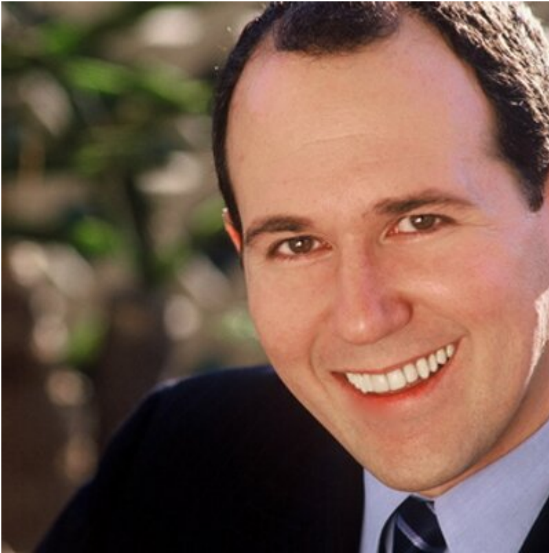
Raymond Arroyo , New York Times bestselling author and host, The World Over Live