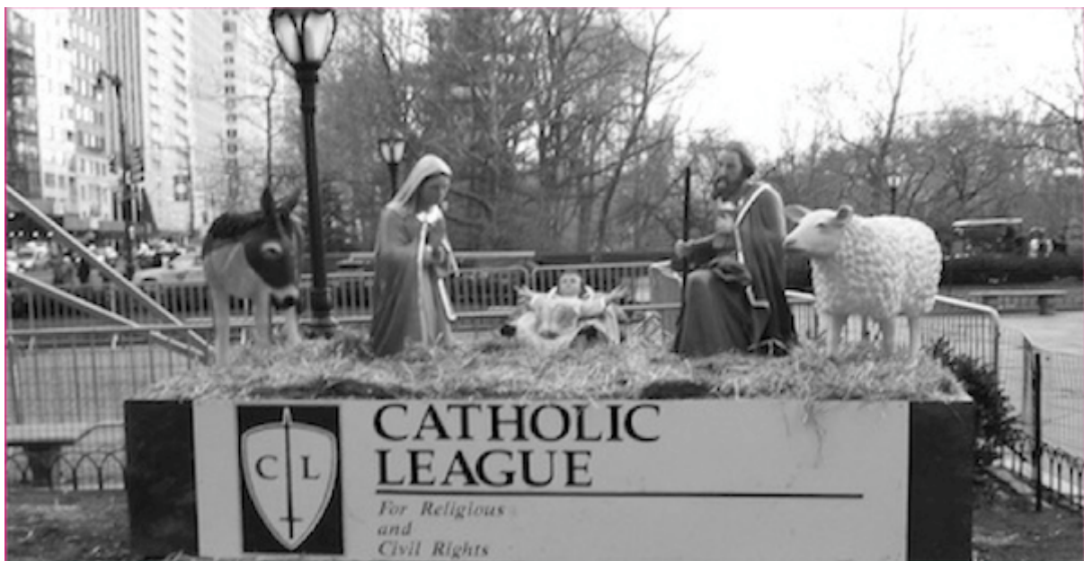
The Catholic League’s nativity scene in Central Park.

Little Rock, AR – Students at Terry Elementary School were invited to see the play, “A Charlie Brown Christmas,” at a local church. Seeking to avoid controversy, no students were required to attend, and bus service was scheduled for those who wished to go. A controversy ensued when one atheist complained, enlisting the help of the Arkansas Society of Freethinkers. In the aftermath of the controversy, the pastor cancelled its student matinee performances of the play.