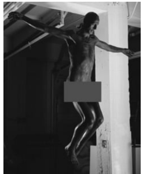
Cavallaro’s “My Sweet Lord” (altered for publication)

New York, NY – A six-foot anatomically correct sculpture of a naked Jesus made out of chocolate, created by artist Cosimo Cavallaro, was scheduled for display during Holy Week at the Roger Smith Hotel art gallery. The hotel planned to display the sculpture on street level where it would be visible through windows; the public was invited to eat the Jesus figure.